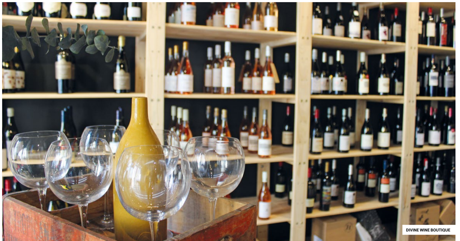
DIVINE WINE BOUTIQUE