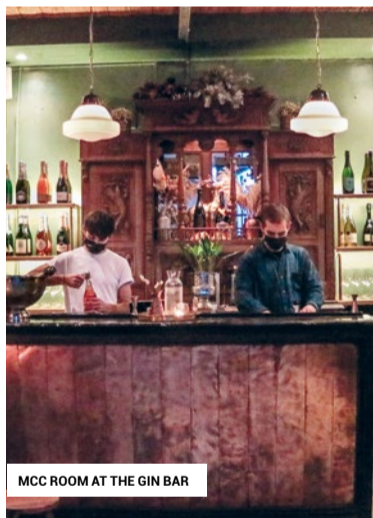
MCC ROOM AT THE GIN BAR