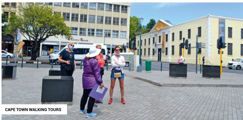
CAPE TOWN WALKING TOURS

9 Lower Long St | www.sky-hiride.capetown