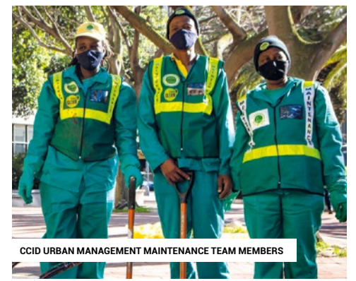
CCID URBAN MANAGEMENT MAINTENANCE TEAM MEMBERS

The place they call "town" had become the subject of disappointment and derision. What the CCID returned to the city – and this will be its abiding gift to Capetonians – is a sense of pride.