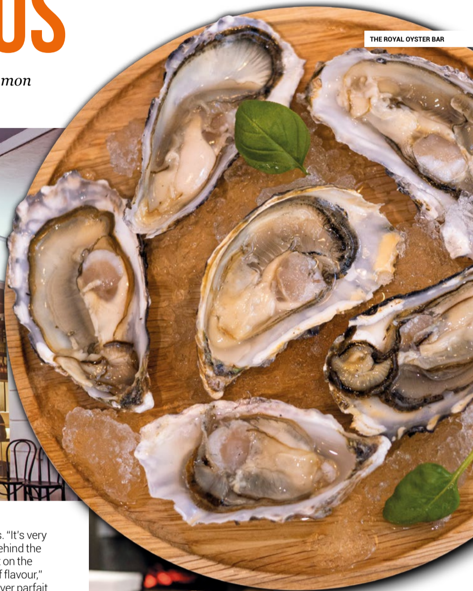
THE ROYAL OYSTER BAR