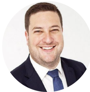
GEORDIN HILL-LEWIS EXECUTIVE MAYOR OF CAPE TOWN

We will continue to work towards an ever-successful downtown, and I encourage you to stay safe this Festive Season: social distance, wear your mask in public (and wear it properly!), sanitise and, if you haven't yet gotten your Covid-19 jab, I urge you to consider doing so without delay.