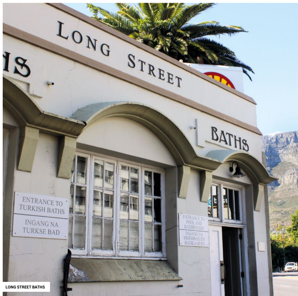
LONG STREET BATHS

On a recent Tuesday morning six women – two in swimming hijabs, three in Speedos, one in a bikini – swam lengths in water of pleasant