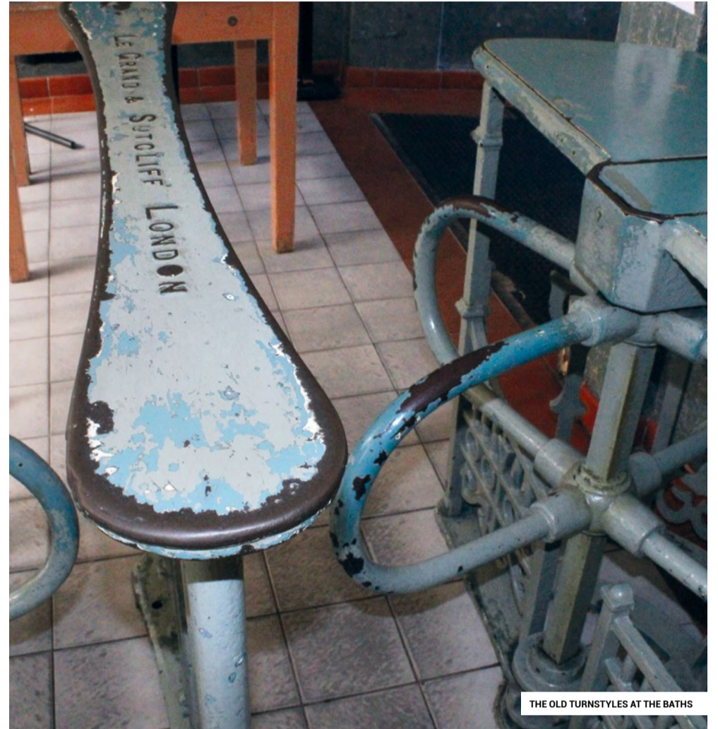
THE OLD TURNSTYLES AT THE BATHS

But there it is, tucked away between a petrol station and one of Cape Town's oldest backpacker lodges. It is surrounded by churches and mosques, bars and restaurants; a quiet old lady, dressed in grey, who has provided solace and exercise and friendship and fun for over a century.