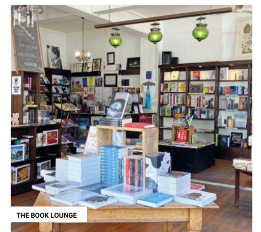
THE BOOK LOUNGE