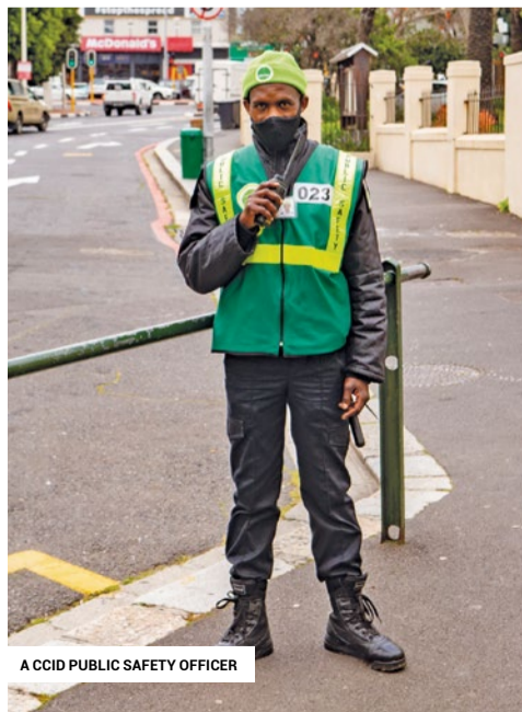
A CCID PUBLIC SAFETY OFFICER

The CBD has made great progress over the last two decades. Investment inflows have been consistent and urban decay is minimal. The role the CCID has played in catalysing change has been enormous. The Central City would not be what it is today had it not been for the CCID.