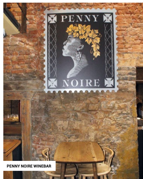
PENNY NOIRE WINEBAR